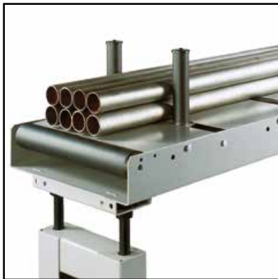
Pair of vertical rollers (Optional)

Unloading roller table with metric rod and length stop, following element with 2m length and max. capacity 600kg.