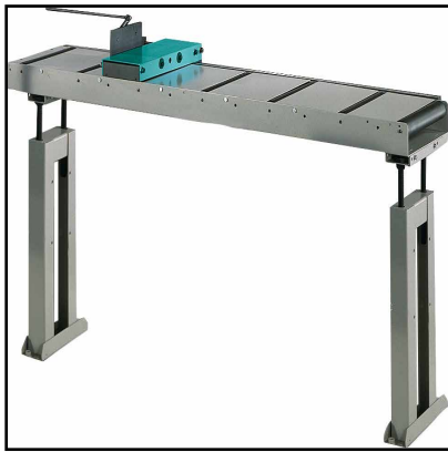
Roller table with metric rod (Optional)